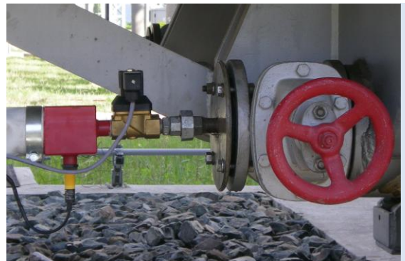
VIMAP RCID F inlet line - Connection to power transformer's bottom valve

No dissolved gasses removed for continuous trending of important fault diagnostic gasses