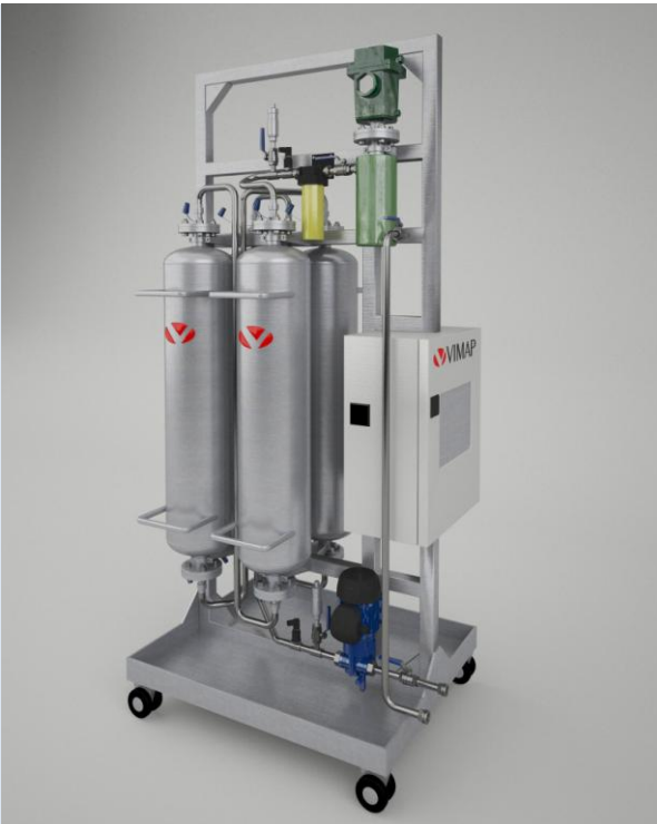
VIMAP RCID F - Frame mounted power transformers insulation dry out system

No oil heating - no undesired effects from oil heating on overall oil quality